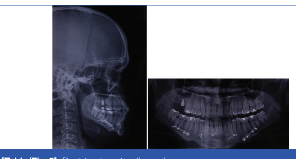
[Table/Fig-5]: Post-treatment radiographs.